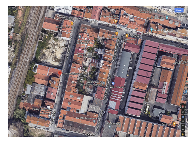
FIGURE 4. Site map (Google Maps).