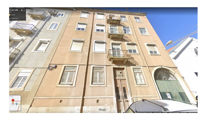
FIGURE 5. Main façade (Google Maps).

returns the standard corresponding composition (materials and construction systems) for Skin (exterior envelope: walls, roofs, doors and windows); Structure (foundations, bearing elements, stairs) and Space Plan (interior walls, partitions, doors, ceilings, floors, sanitary fittings and kitchens). The Service layer is not considered, because, it varies from one building to another.