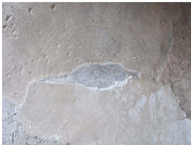
Figure 4: Particular of geometric patterns in the ancient plaster.