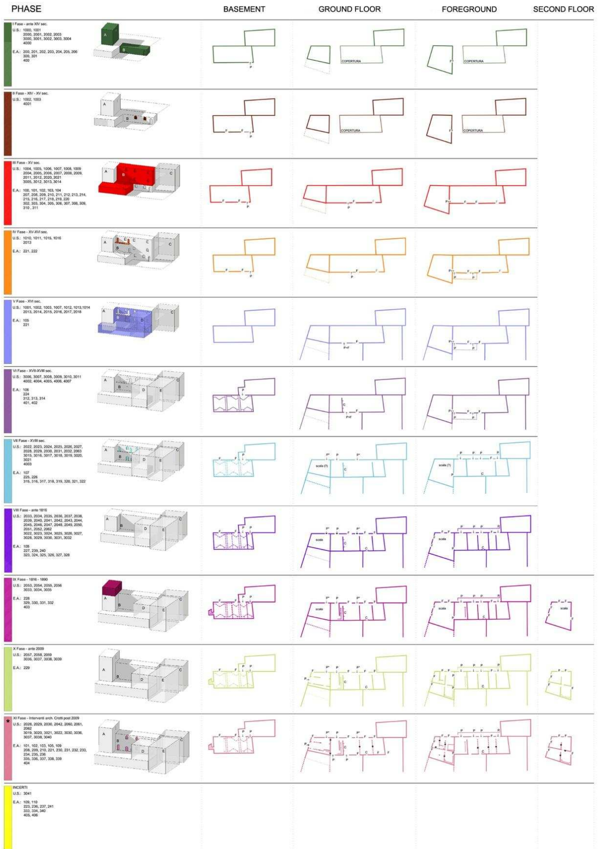
Figure 5: Schematic representation of the building's historical evolution on the different levels.