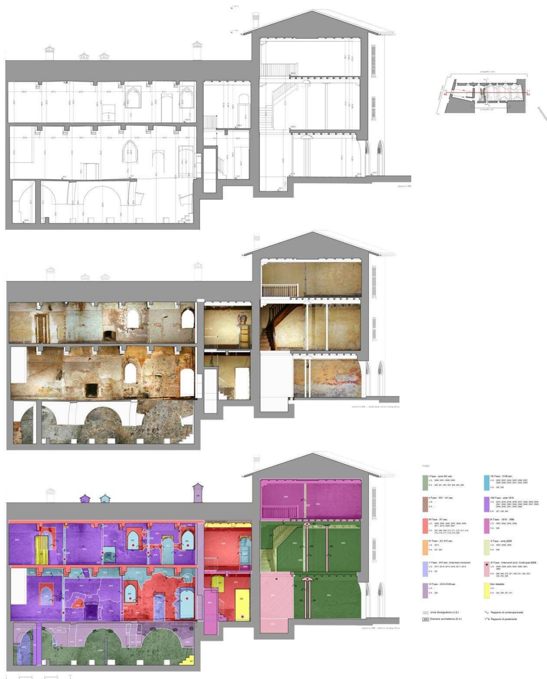
Figure 1: Longitudinal section (BB) - geometric survey, photographic rectification and stratigraphic reading

provided further verification of the quality of the results. This was in order to provide a solid ‘foundation’ for the formulation of a more aware overall chronological framework of the construction of the architectural palimpsest being studied.