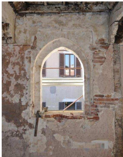
Figure 2: Particular of a ogive window (XIV-XV century) on the south front