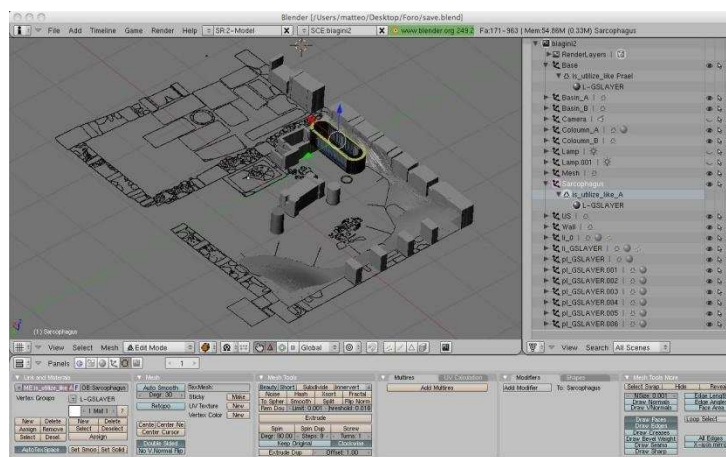
Figure 2: The Blender plugin in action on the Uchi Maius 3D Data

In a previous work we already described in technical terms the process of building a CityGML representation of a 3D models and how the archaeologists can enrich the CityGML code with CIDOC-CRM entities to insert semantic information into the model itself (e.g. historical information like the year of foundation or destruction of the city and so on) [16]. We have the process more efficient and the interaction of the Blender plugin with the system is now straightforward. The new Blender plugin is now able to download the CityGML encoded version of one of our 3D models (generated directly by the repository), to import it into Blender, to enrich it with CIDOC-CRM code and to re-ingest it back into its original context (Figure 2):