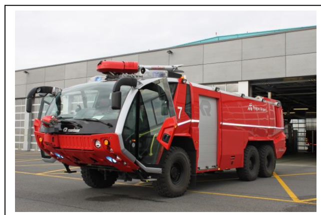
Figure 1. Panther Rosenbauer [10]

Risk of inaccessible 900 m before THR 24L when using the south route is undesirable, risk index is 3B and safety recommendation is construction of special rescue and access road from the street Na Padesátníku V to the area 900 m before THR 24L with the minimum width 3 m and with the load capacity permitting exceptional use by vehicles of total weight 33 000 kg and ensuring clearance height 3,6 m in the street Na Padesátníku V by cutting the branches of the trees. Final risk after implementation of this recommendation is acceptable, 1B.