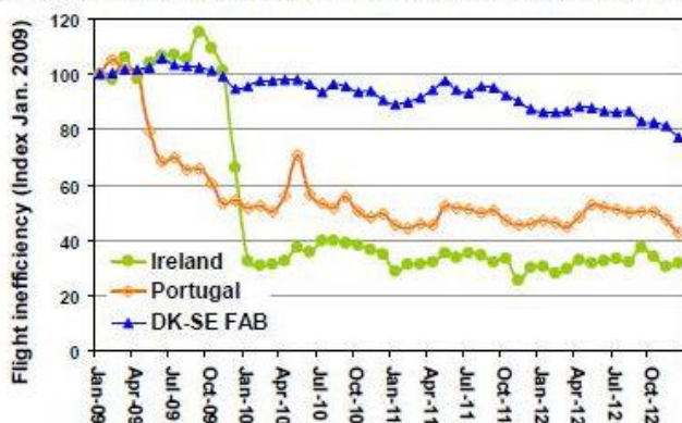
Figure 1. Flight inefficiency decrease linked to introduction of FRAP in Ireland, Portugal and FAB DK/SE Source: [2]

Based on the shortest routes available October 2013 during AIRAC cycle 1013, the shortest possible distances were