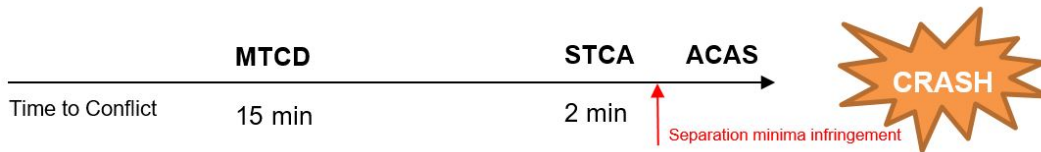
Figure 2. Order of the tools how they are activated according to the time remaining to the conflict.